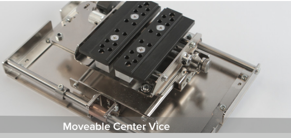
Moveable Center Vice