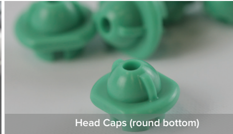
Head Caps (round bottom)