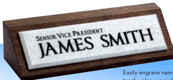
Easily engrave nameplates, trophy plaques and awards.